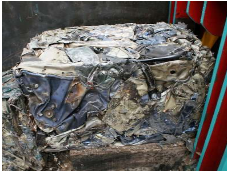
B1 Car Bodies