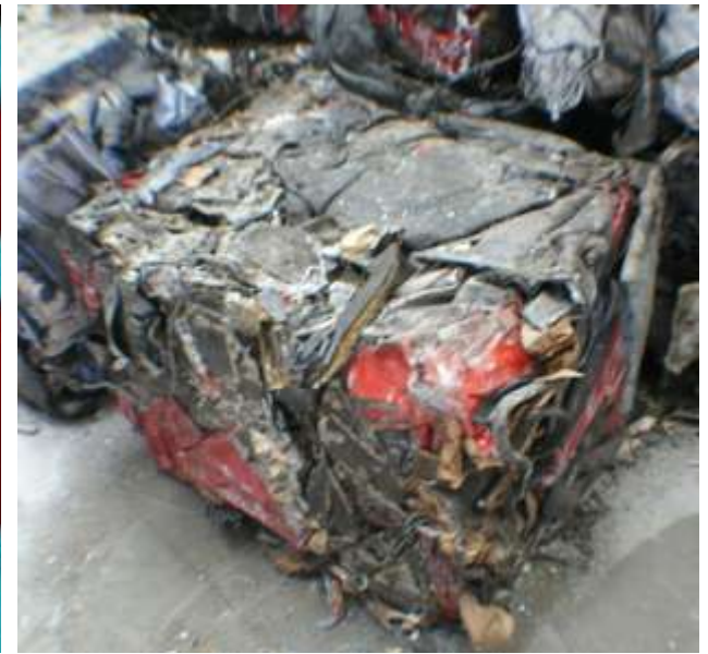
B3 Car Bodies Delivered

B1 TAR has large quantities of baled car body steel available for export. The bale dimensions are 600mm X 600mm X variable length. The bales are intended for sale as 'Insize Steel Scrap'.