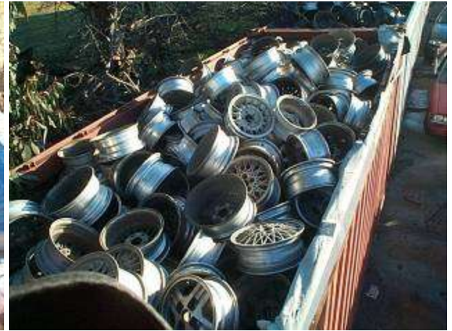
A1 Alloy Wheels