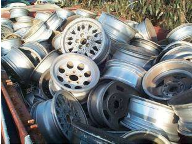
A1 Alloy Wheels