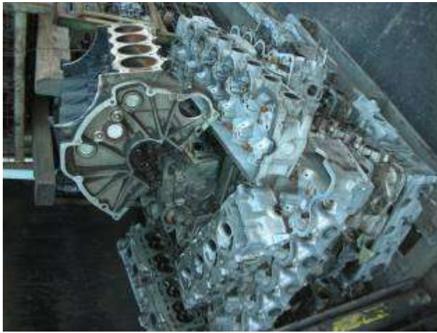
A4 Irony Alloy 90%