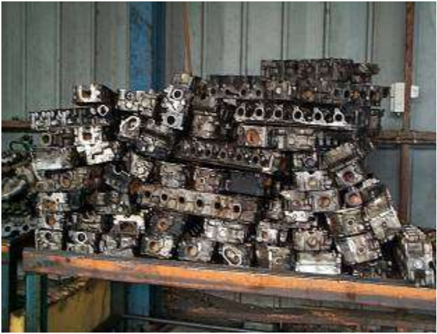
A4 Irony Alloy 90%