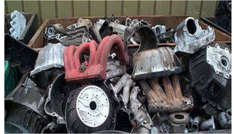
A3 Clean Cast Alloy