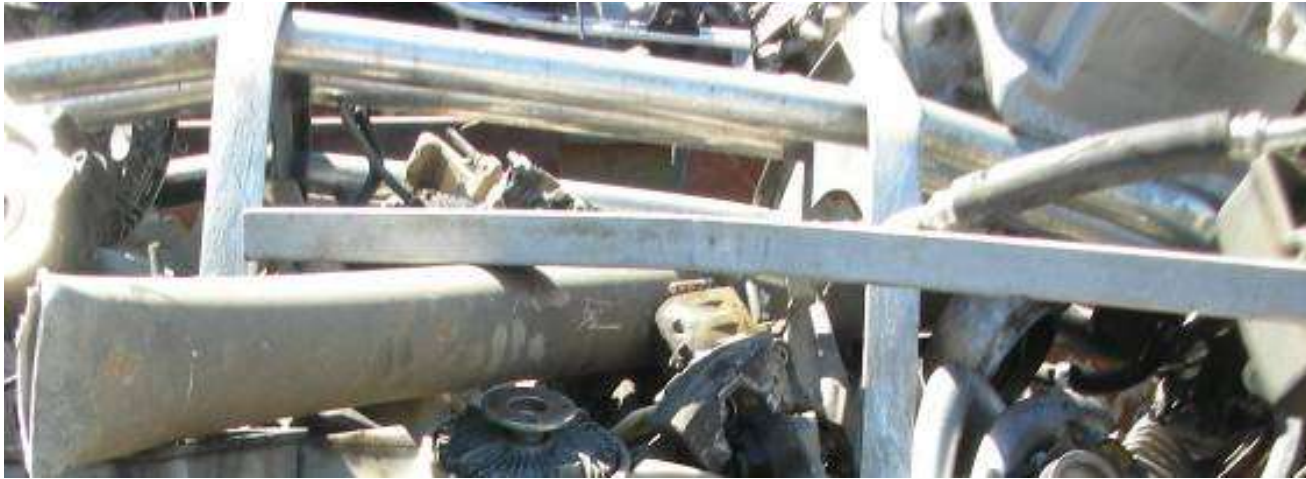
A2 Aluminium Extrusion