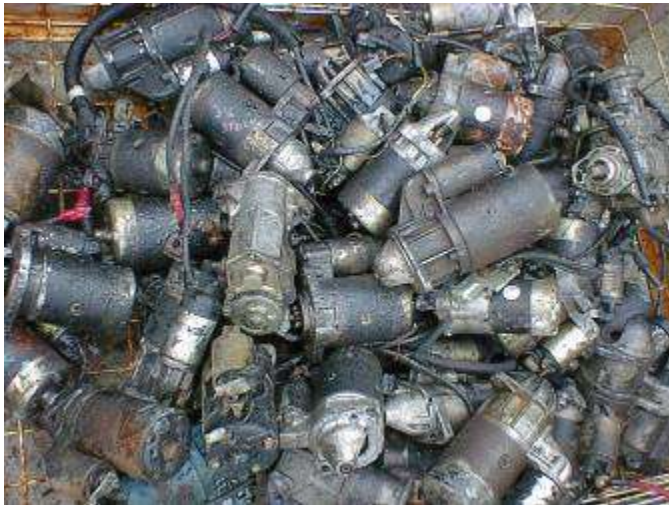
C3 Electric Motor Scrap