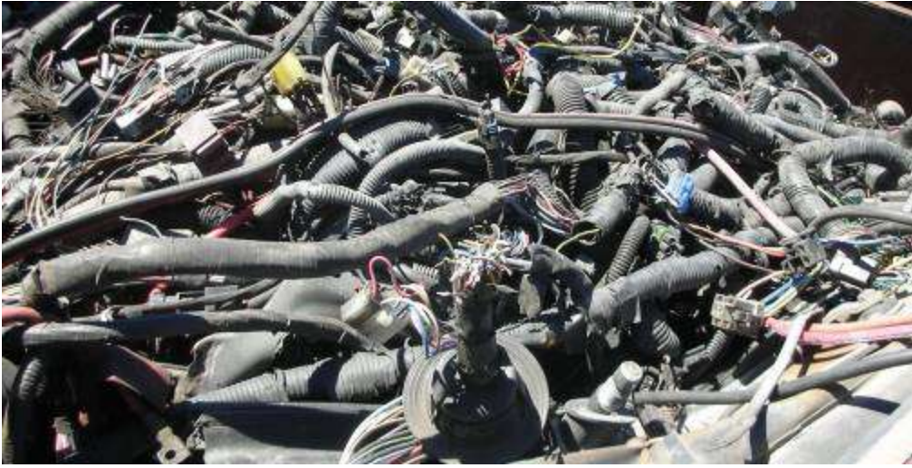
C4 Copper Wiring Looms approx 45% Cu