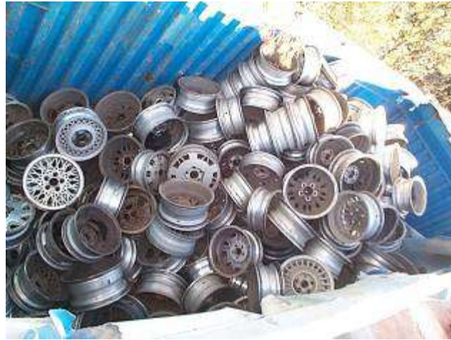
A1 Alloy Wheels