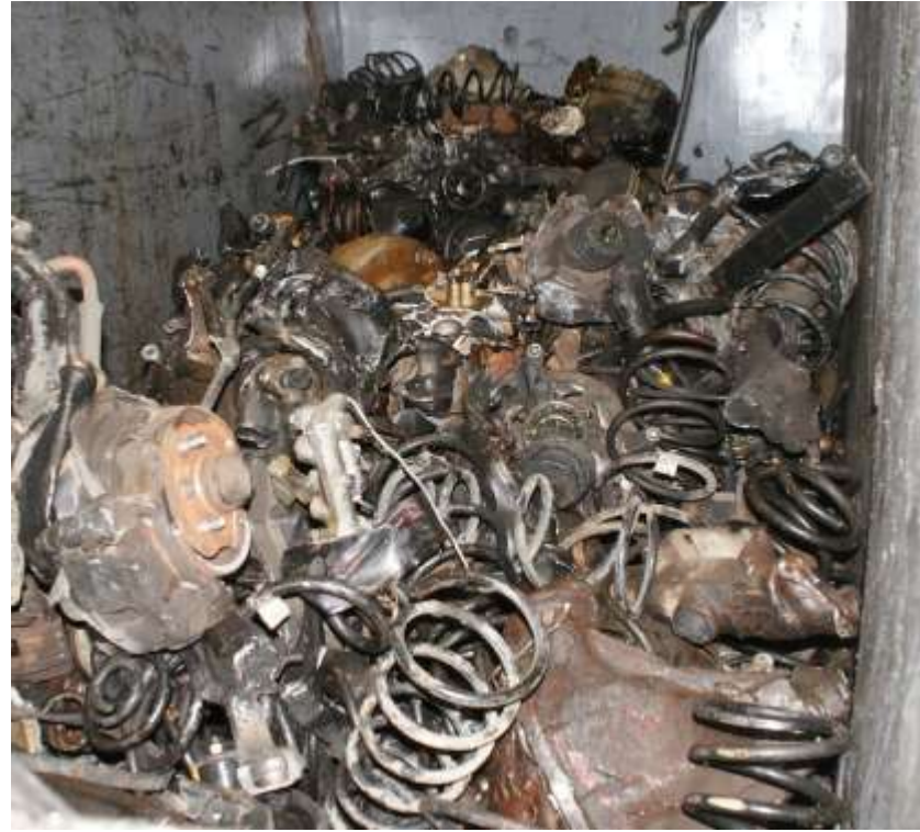
HMS 1 & 2 Iron and Steel