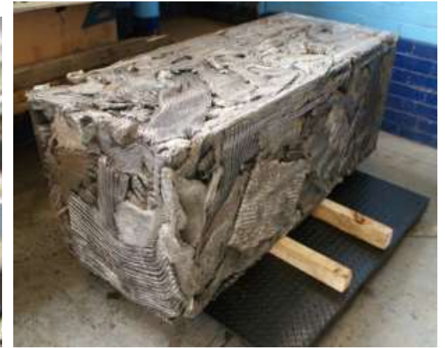
A5 Baled Aluminium. Radiators & Condensers