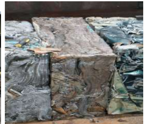
C1 Compressed Copper Radiators