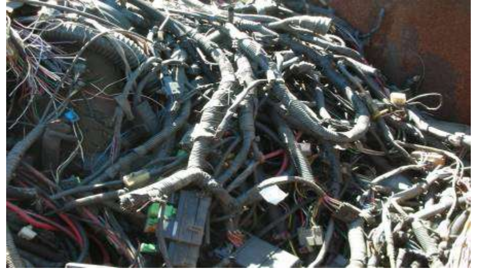
C4 Copper Wiring Looms approx 45% Cu