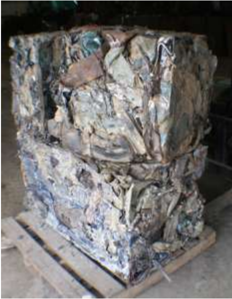
B1 Baled Car Bodies