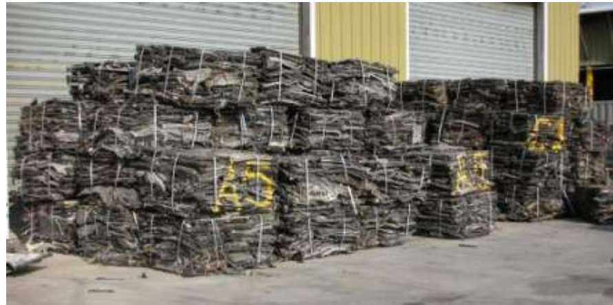
C1 Copper Radiators Clean