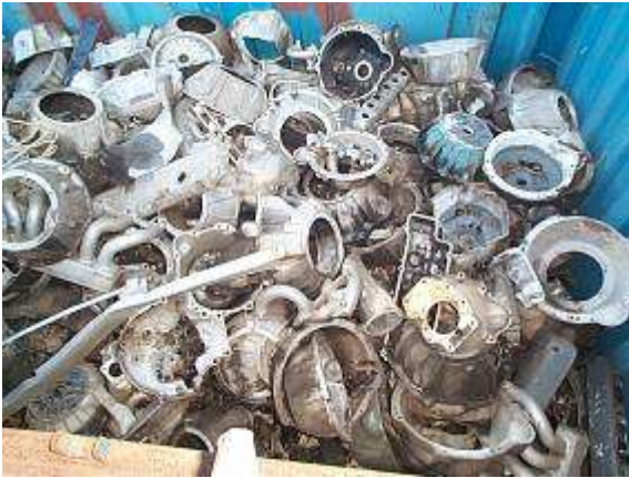
A3 Clean Cast Alloy