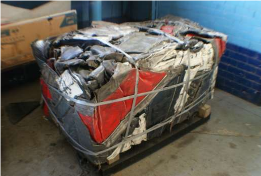
Baled Polyurethane Plastic Bumper Bars ( may contain small amounts of metal screws and clips )