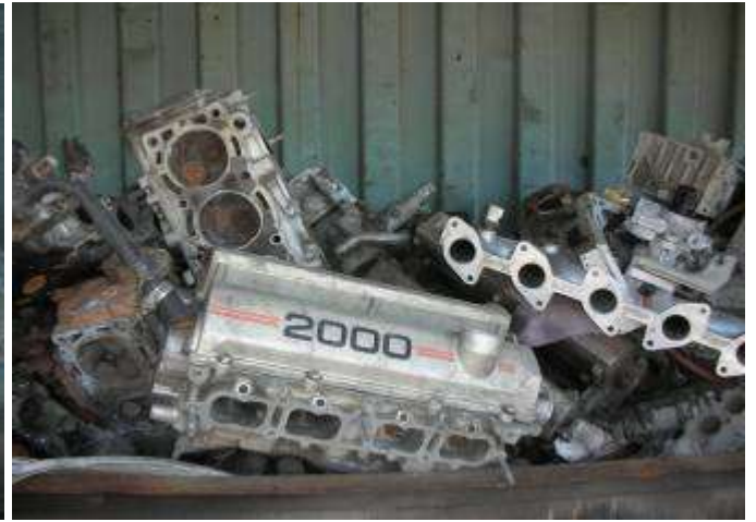
A4 Irony Alloy 90%