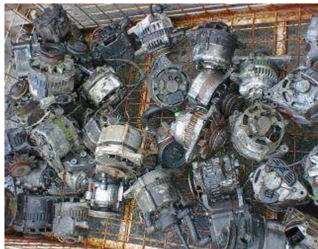
Starter Motors and Alternators