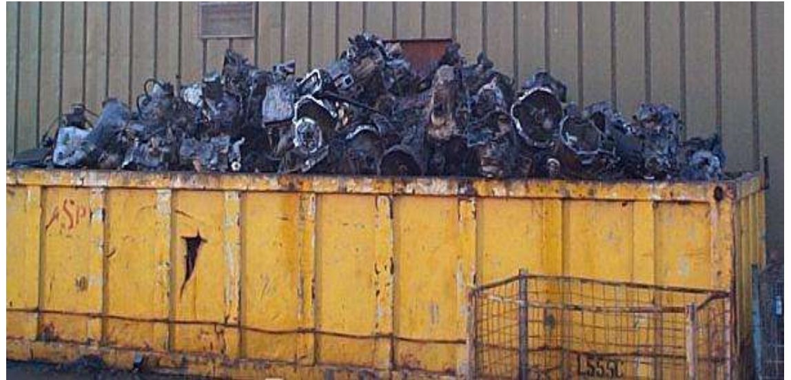
A7 Irony Alloy 35% Transmissions