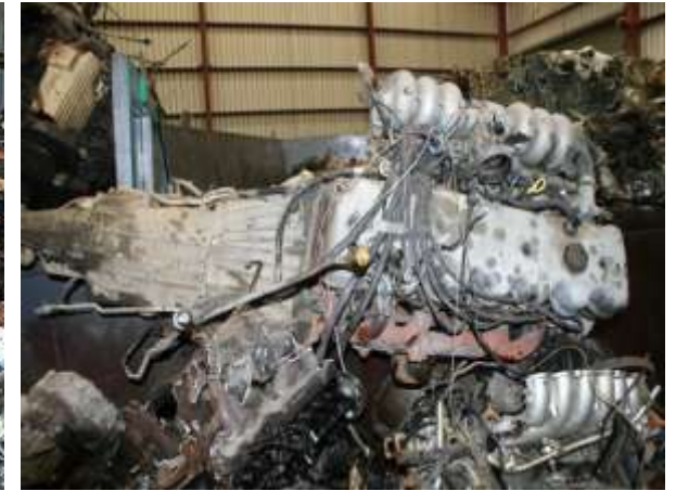
A9 Heavy Irony 25% alloy Engines & Gearboxes