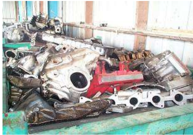
A3 Clean Cast Alloy