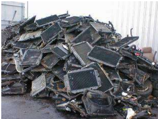
C2 Dirty Radiators (copper/brass/plastic/Fe/ Some electric motor scrap)